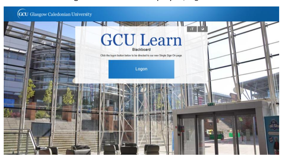
Figure 1: GCU Learn Login screen

As GCU Learn is a web-based system, you can access it through any computer that is connected to the Internet. Access directly using the following web address: <a href="http://blackboard.gcal.ac.uk">http://blackboard.gcal.ac.uk</a> or click on the GCU Learn link from the Student home page. The GCU Learn Login screen will be displayed, Figure 1.