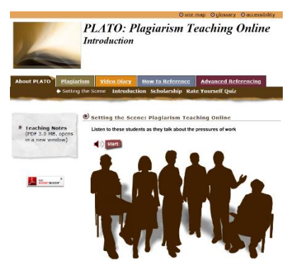
Figure 17: PLATO website

Once logged in you will see the PLATO: Plagiarism Teaching Online Introduction screen, Figure 17. Click on the links and tabs for further information.