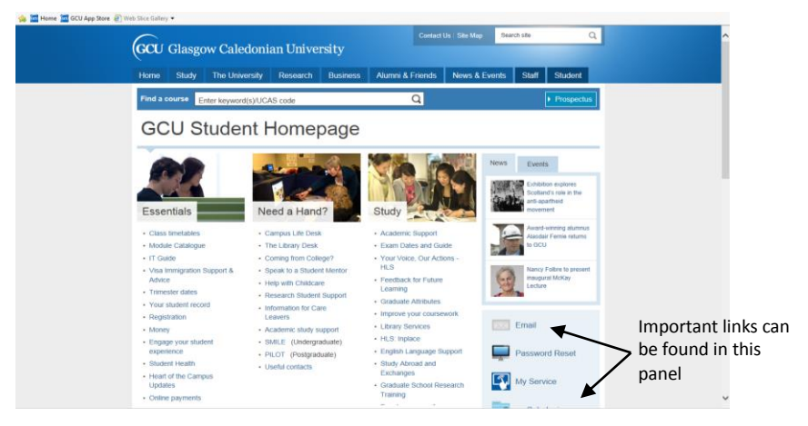
Figure 9: The Student home page

The Student Homepage contains information which will be useful to you as a student. The information is grouped in sections. Some of the most common links on this page have been brought together on the right hand side for ease of access: Email, GCU Learn, Library, my Caledonian and so on.