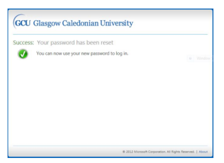
Figure 8: Success: Your password has been reset page