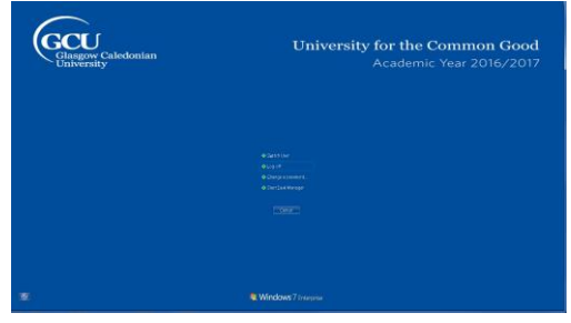
Figure 1: Windows Security screen

To change your password you must log on to the system with your old password. Then press the Ctrl+Alt+Delete keys on your keyboard. You will see the following screen: