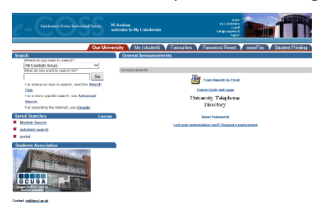
Figure 11: my Caledonian home page

Once you have successfully logged in you will see the welcome page. There are a number of tabs at the top of the screen, Figure 11.