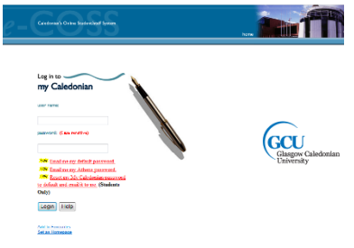
Figure 10: my Caledonian login page

username and password in the fields provided and click on the Login button, Figure 10.