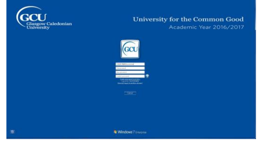
Figure 2: Change Password screen

• Click on the Change a password option. You will see the following screen: