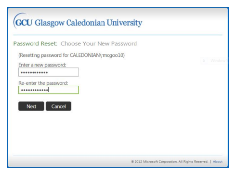
Figure 6: Password Reset: Choose Your New Password page

Enter a new password in the field and then re-enter it in the field below.