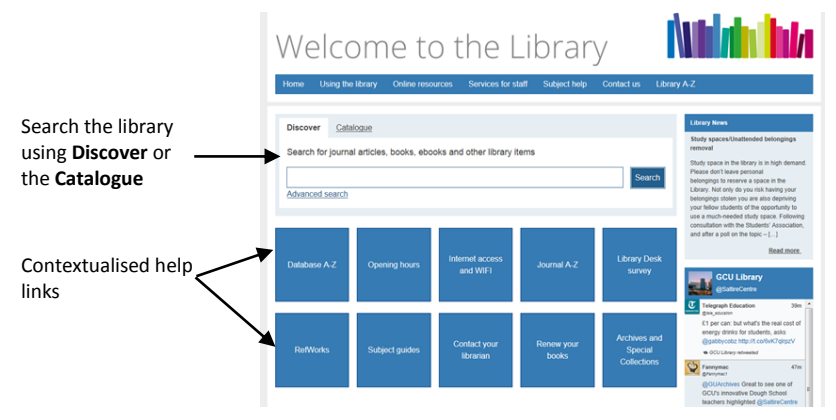
Figure 15: Welcome to the Library screen

The Library website <u>http://www.gcu.ac.uk/library</u> is the starting point for using the Library and finding information.