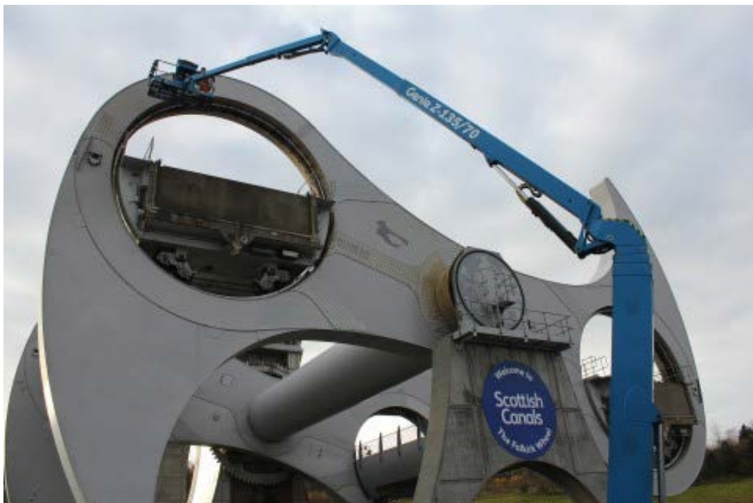
Image: The Falkirk wheel gets an MOT.

https://www.scottishcanals.co.uk/media-centre/galleries/the-falkirk-wheel-gets-an-mot .