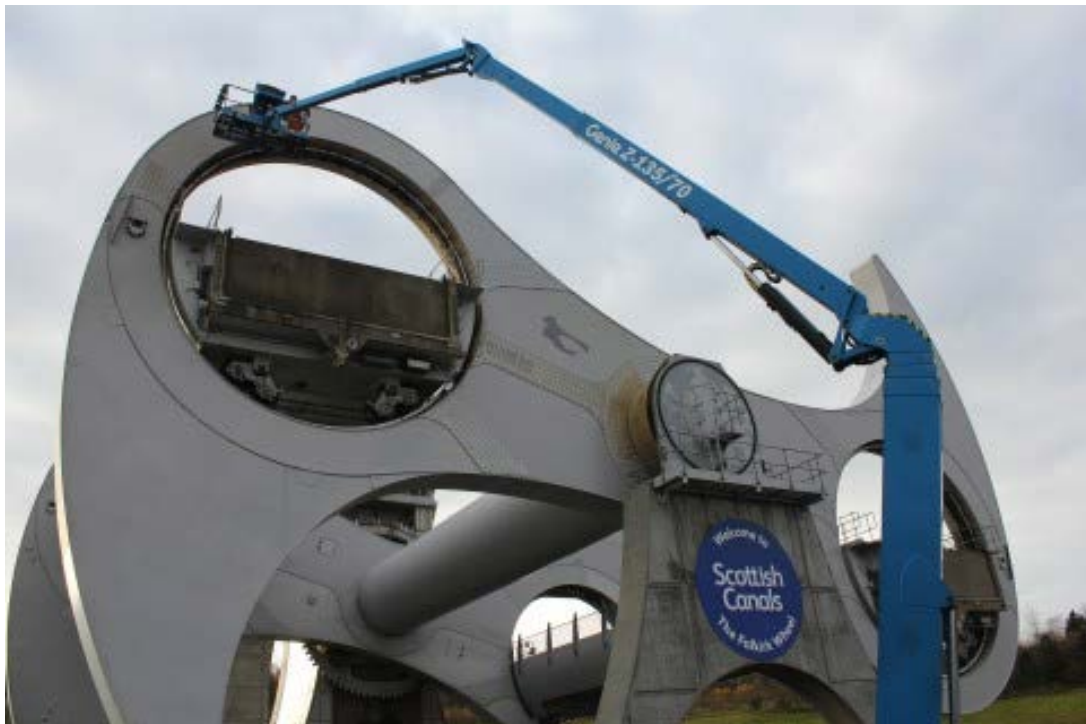
Image: The Falkirk wheel gets an MOT

https://www.scottishcanals.co.uk/media-centre/galleries/the-falkirk-wheel-gets-an-mot .